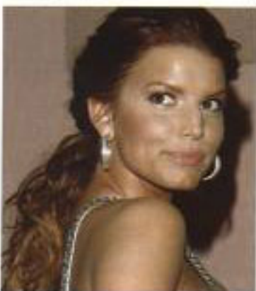
Jessica Simpson was such a big fan of hair extensions that she decided to create her own clip-on extension range. Alternating between long and tousled curls to straight and slender, Jessica's extensions add body to the hair.