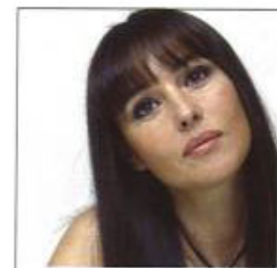
Famous Italian actress Monica Bellucci is a fan of extensions, especially Great Lengths and uses hair extensions as a means of adding volume to the hair, rather than length.