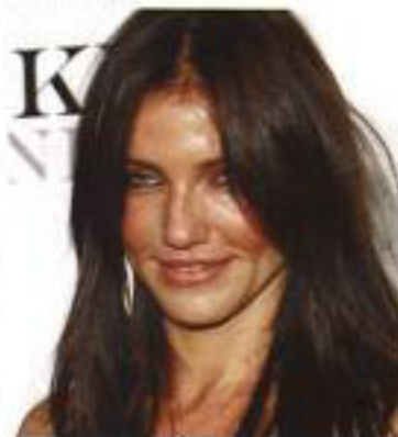
Cameron Diaz wowed red carpet paparazzi when she attended ex-boyfriend Justin Timberlake's album launch with flowing dark locks.