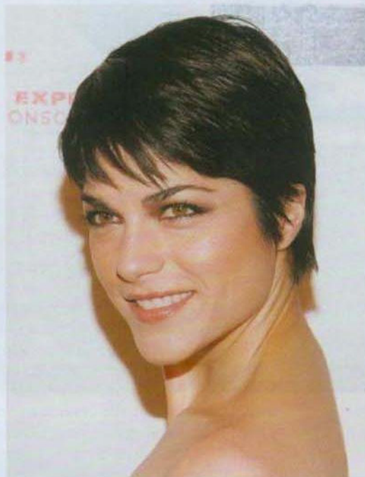
Selma Blair was daring enough to go for a short boy cut with a sweeping fringe to bring out her eyes