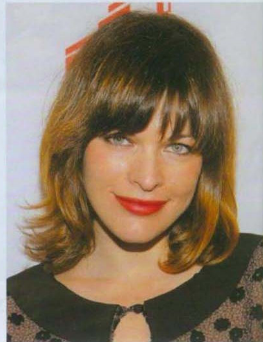
Milla Jovovich has always favoured shorter hair and adds layers to give her hair more movement