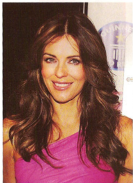
Liz Hurley credits her enviable volume to having a helping hand from extensions