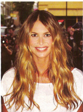
Elle Macpherson adds length to her golden locks with hair extensions